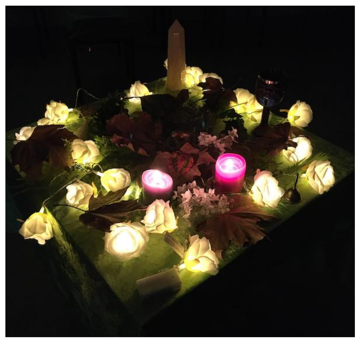
Nowra Circle's Altar

Spellwork – Our spellwork activity was focusing on the joy and abundance in our lives and imbuing that into clay charms that we created.