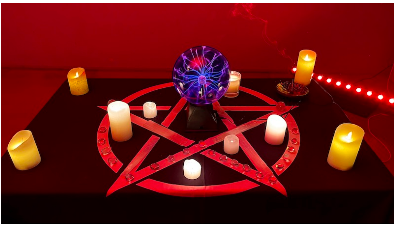
Sydney Circle's altar

When you are ready, move your fingers and toes, and open your eyes.