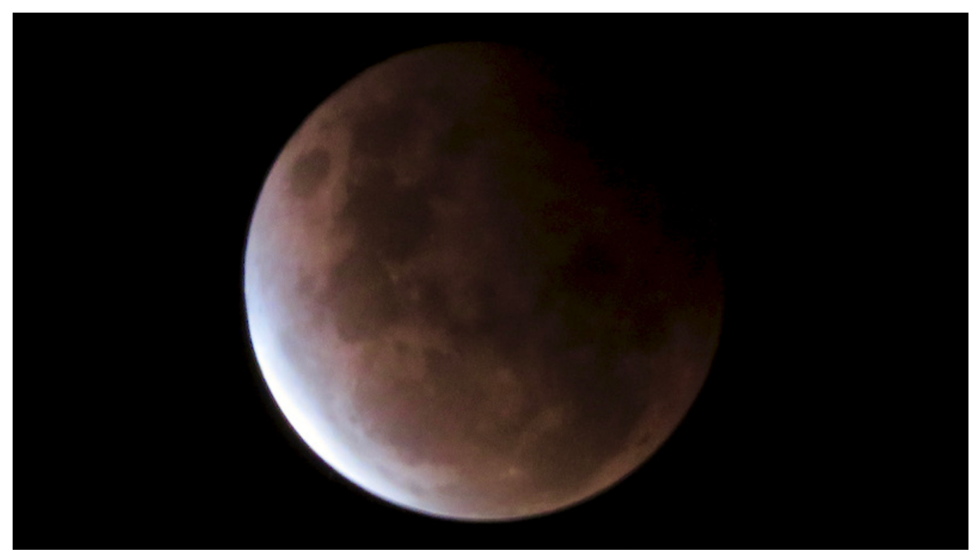
Photo of Full Moon in Sagittarius Total Lunar Eclipse.

The Gemini-Sagittarius polarity is a mental axis, where Gemini represents the "lower mind" and Sagittarius represents the "higher mind," we can begin to understand why striking a balance is ideal.