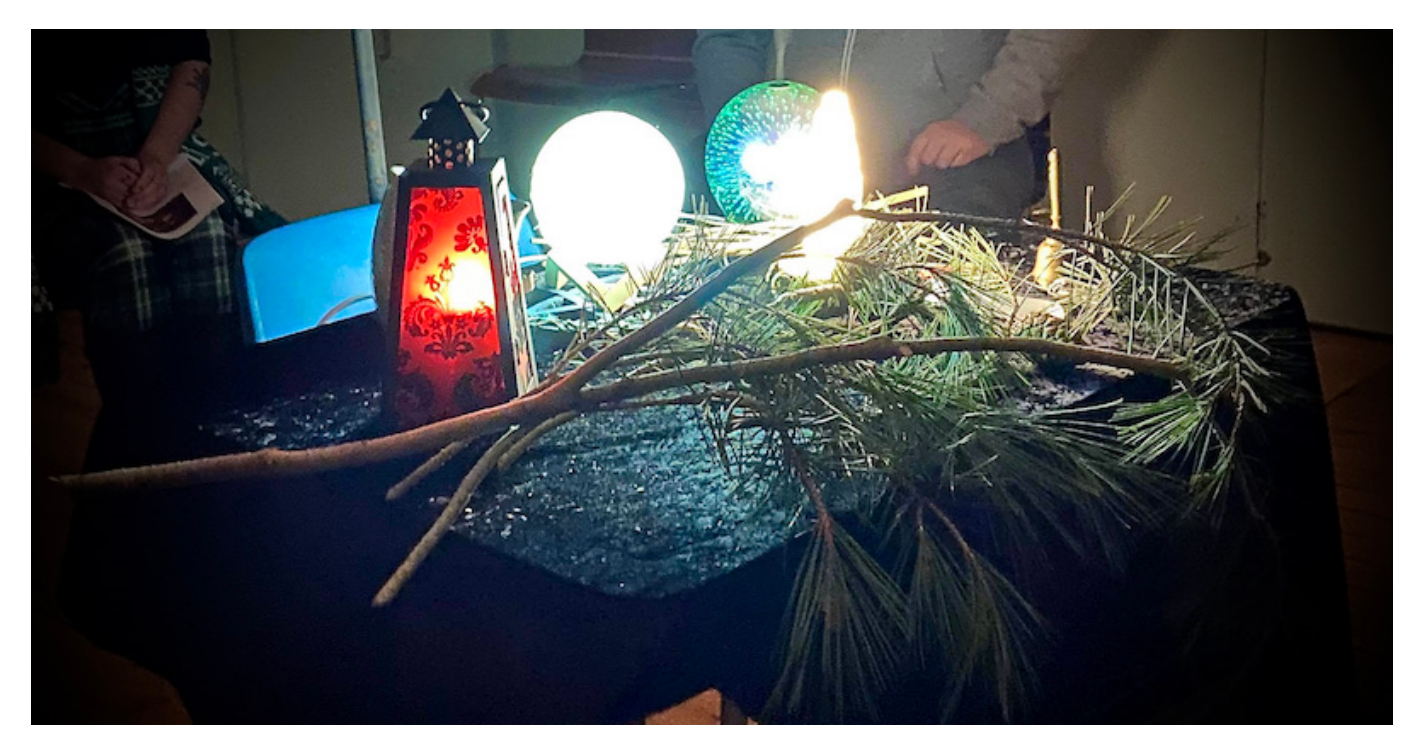
Canberra Circle's altar