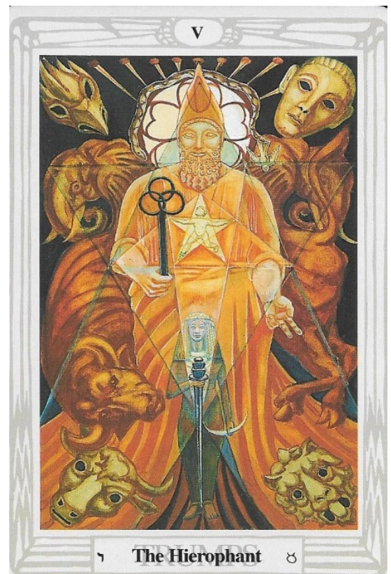
Above: “Thoth Tarot” written by Aleister Crowley, illustrated by Lady Frieda Harris