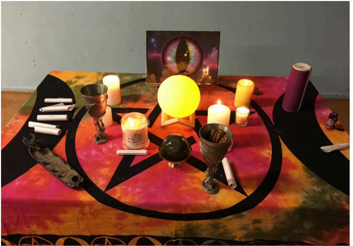
The Sydney circle's altar with cinnamon sticks rolled up in paper.