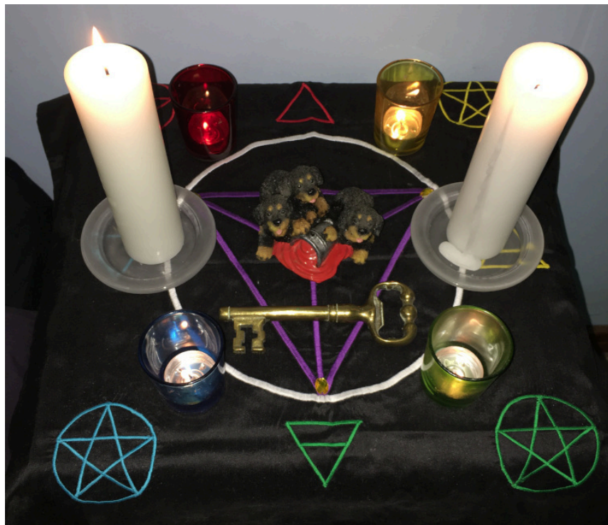
Jenny's altar with Hecate's 3 black dogs and Hecate's key.