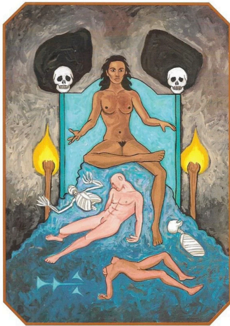
13 DEATH • ERESHKIGAL

have let go of our own shackles and faced our fears, we can rise like the phoenix back into a new reality with new hope and enthusiasm.