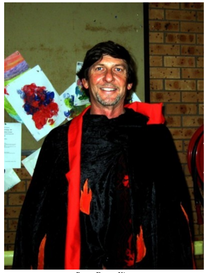
Ray - Faery King