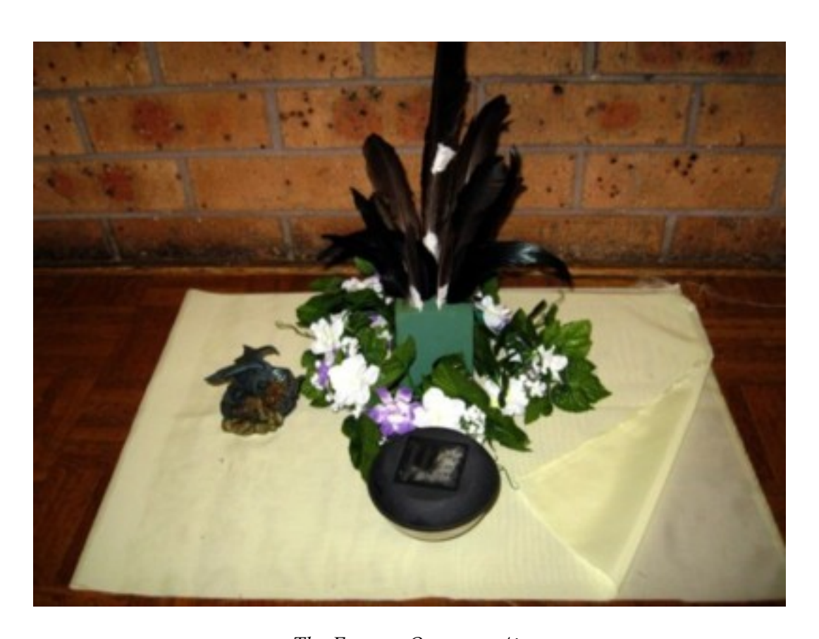
The Eastern Quarter - Air