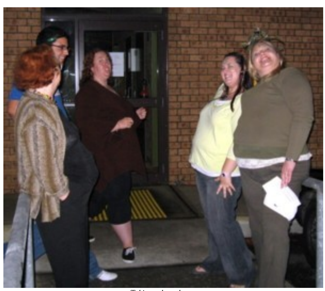
Taking a breather...