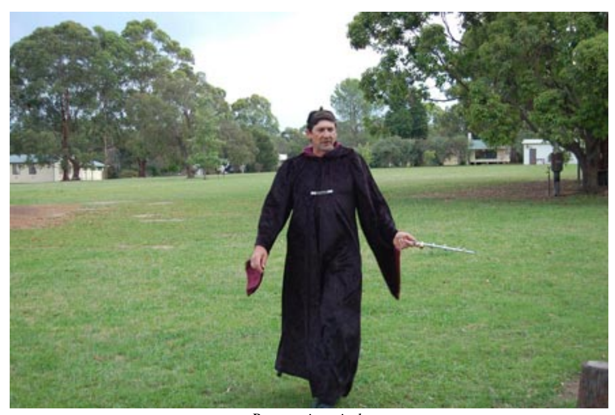
Ray casting circle

We are a circle within a circle With no beginning and never ending We are a circle a living circle With no beginning and never ending