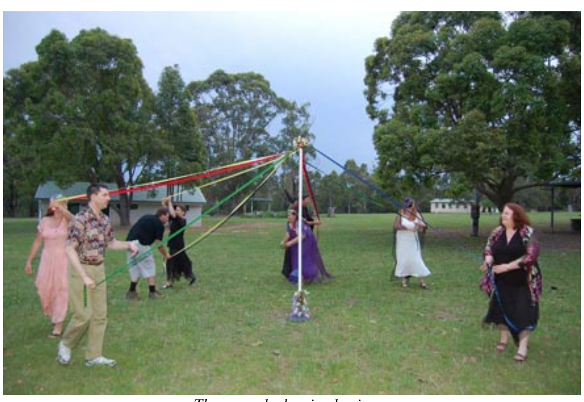
The maypole dancing begins...