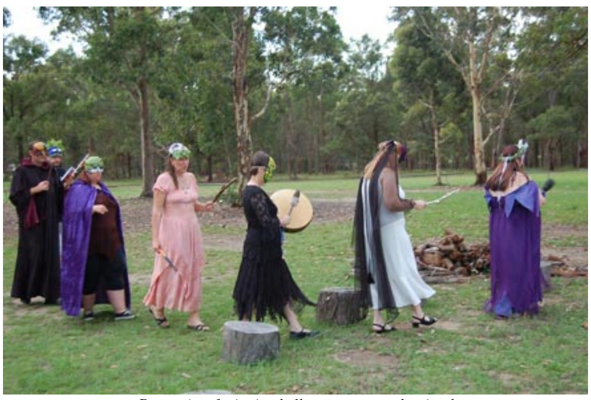
Drumming & ringing bells to announce the ritual

Members walk to the circle drumming and ringing bells to let the Fey folk know that that our ritual to honour them has come. When we have formed a circle we will sing: