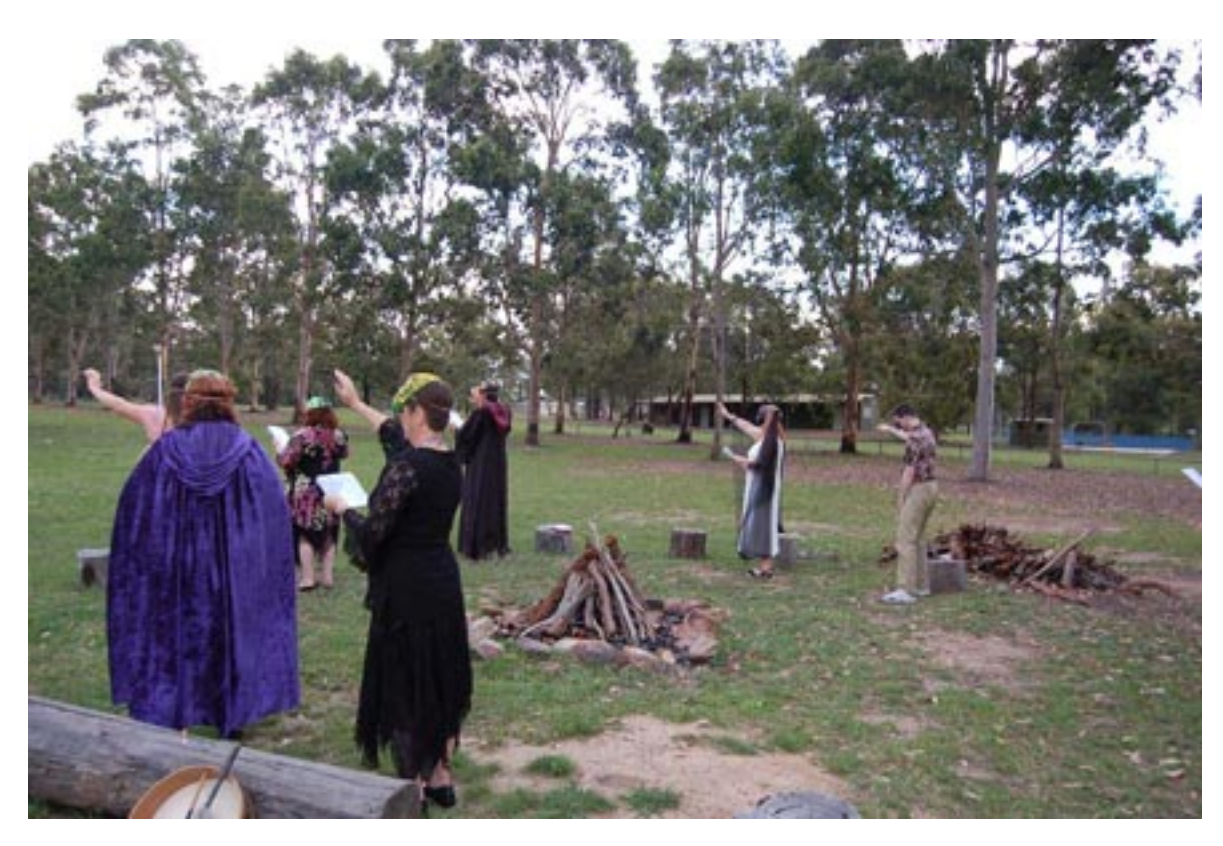
Calling the western quarter

Rulers of Water, Undines, sprites and elemental beings We do call upon you to witness this rite and guard this circle. So mote it be.