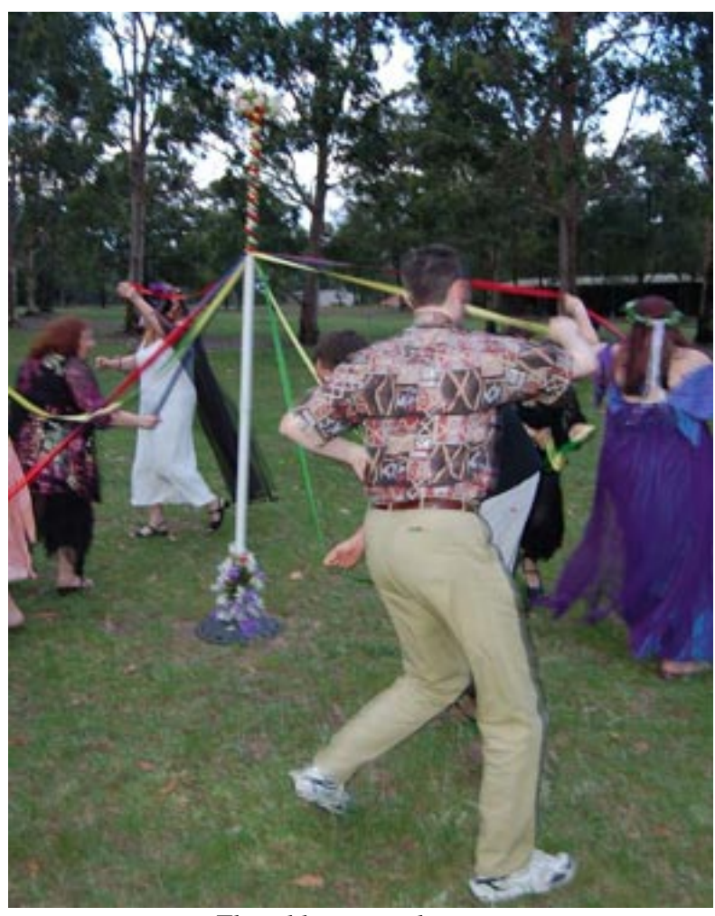
The ribbons get shorter...