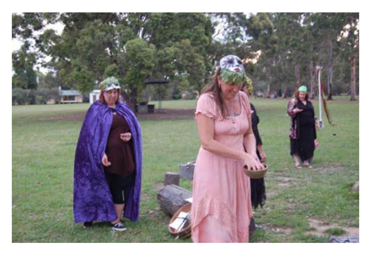
Fairy Queen & Green Man sprinkling candy & rose petals

Fairy Queen and Green Man walk around the circle sprinkling rose petals and candy. Candy is given to the participants. We all then dance around the May Pole.