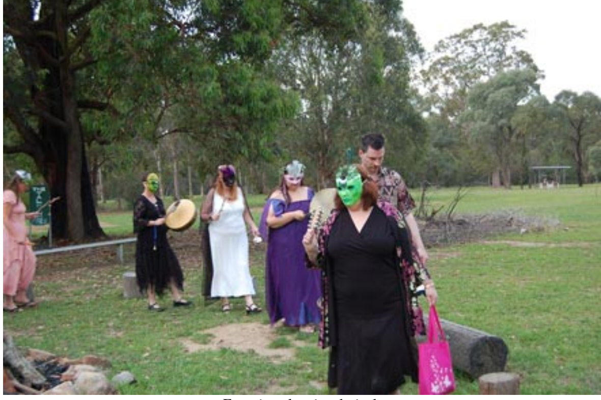
Entering the ritual circle