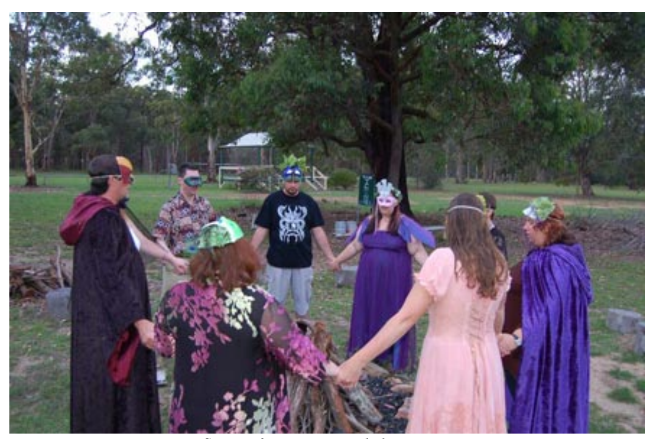
Singing & connecting with the energies

Take time to allow yourself to be open to the flow of the Universe and the ways in which you can experience new avenues of consciousness in your life. Connect with the elemental energies. Join hands and sing we are a circle connecting in mind with the elemental beings.