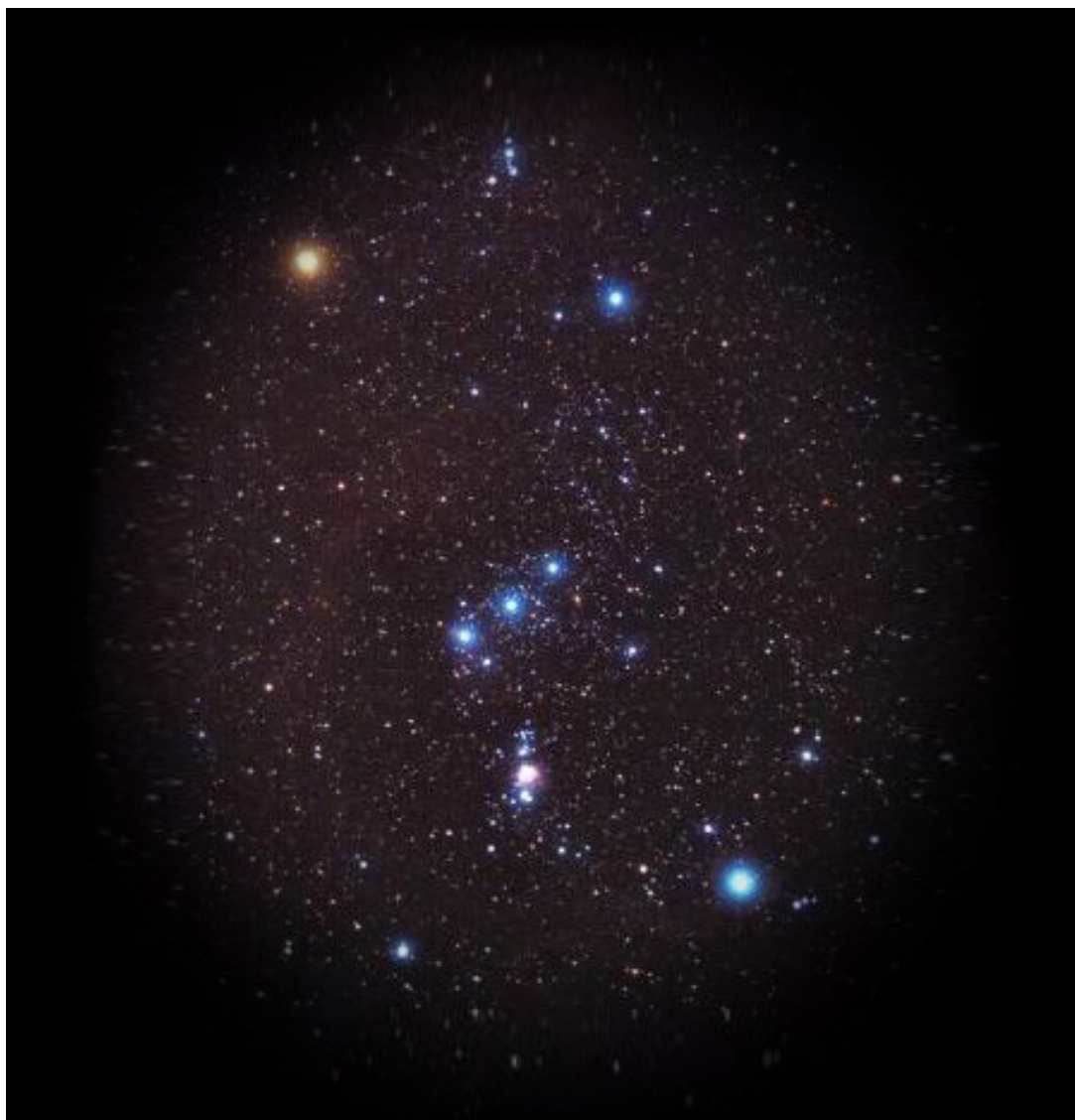
Bellatrix (blue star, top right) in the Orion Constellation

A star alignment is when the star or star constellation in question is aligned back into the earth plane in harmony with us. During the time of the lunar eclipse there will be a star alignment with Bellatrix, 'the Conqueror' which is in the constellation of Orion, the saucepan in the sky, a very familiar sight to the Southern hemisphere sighted all year round and in the Northern hemisphere sighted as the Hunter. Orion has a very strong connection with Earth and to the Ancient Egyptians was the star system the eternal pharaoh returned to. Osiris the Pharaoh/God, who was tricked by Seth and cut into parts that were then gathered back again by Isis/Sirius his sister/wife and unified.