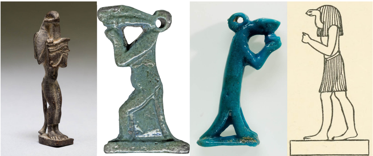
Images of Nehebkau