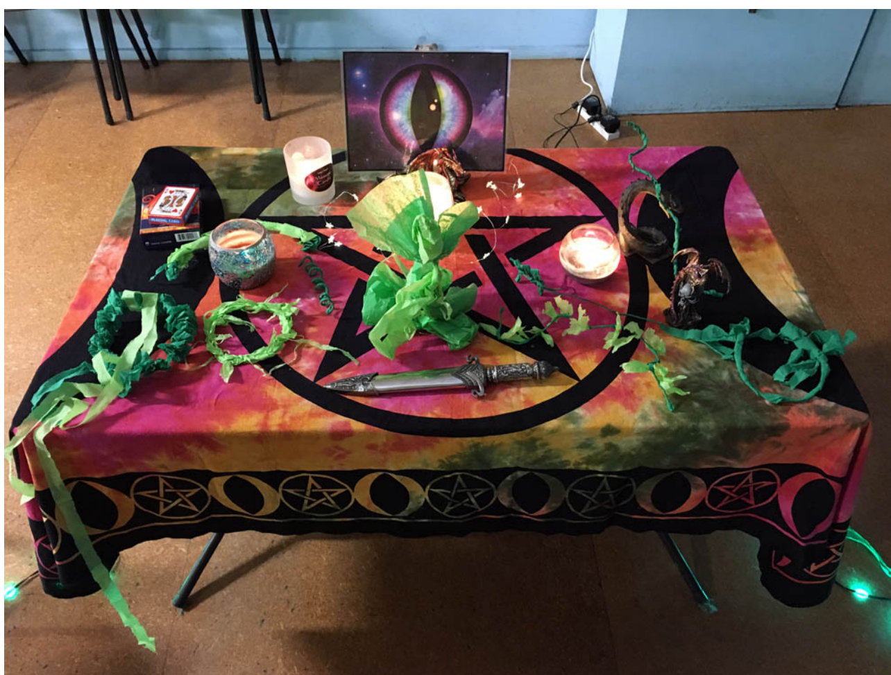
The altar at the full moon circle at Loftus., showing the vines we made to bring in new growth.