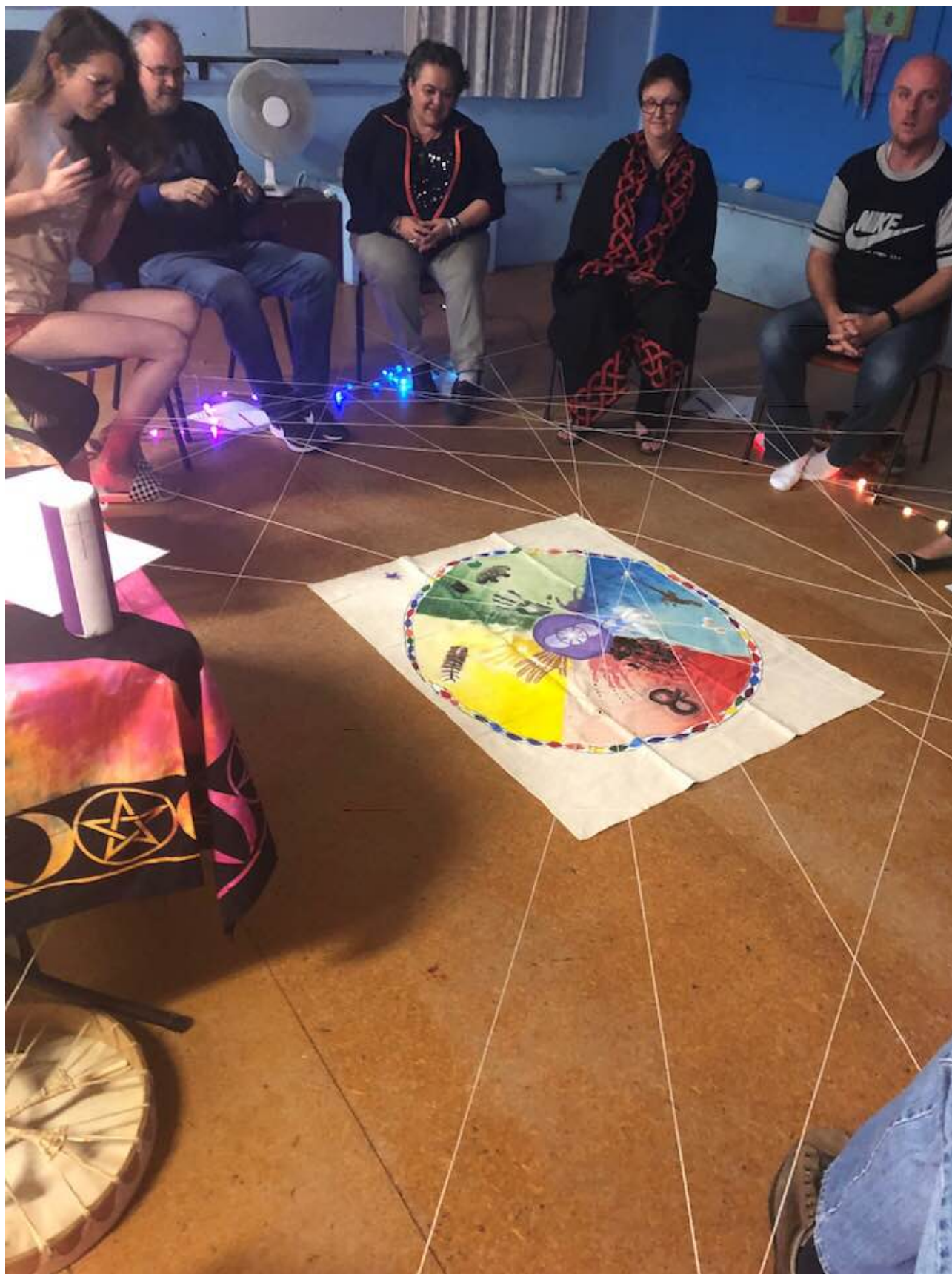
Loftus Circle's spider web.