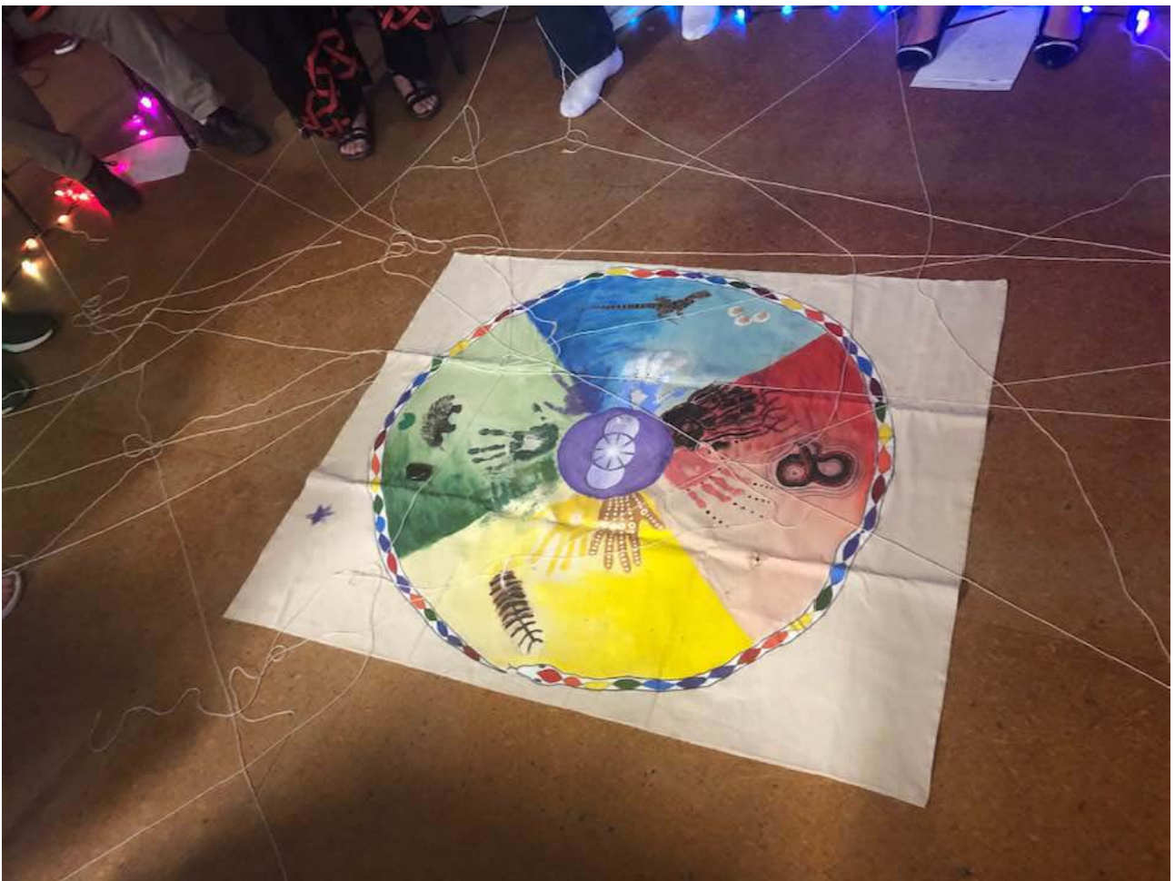
After the web was cut