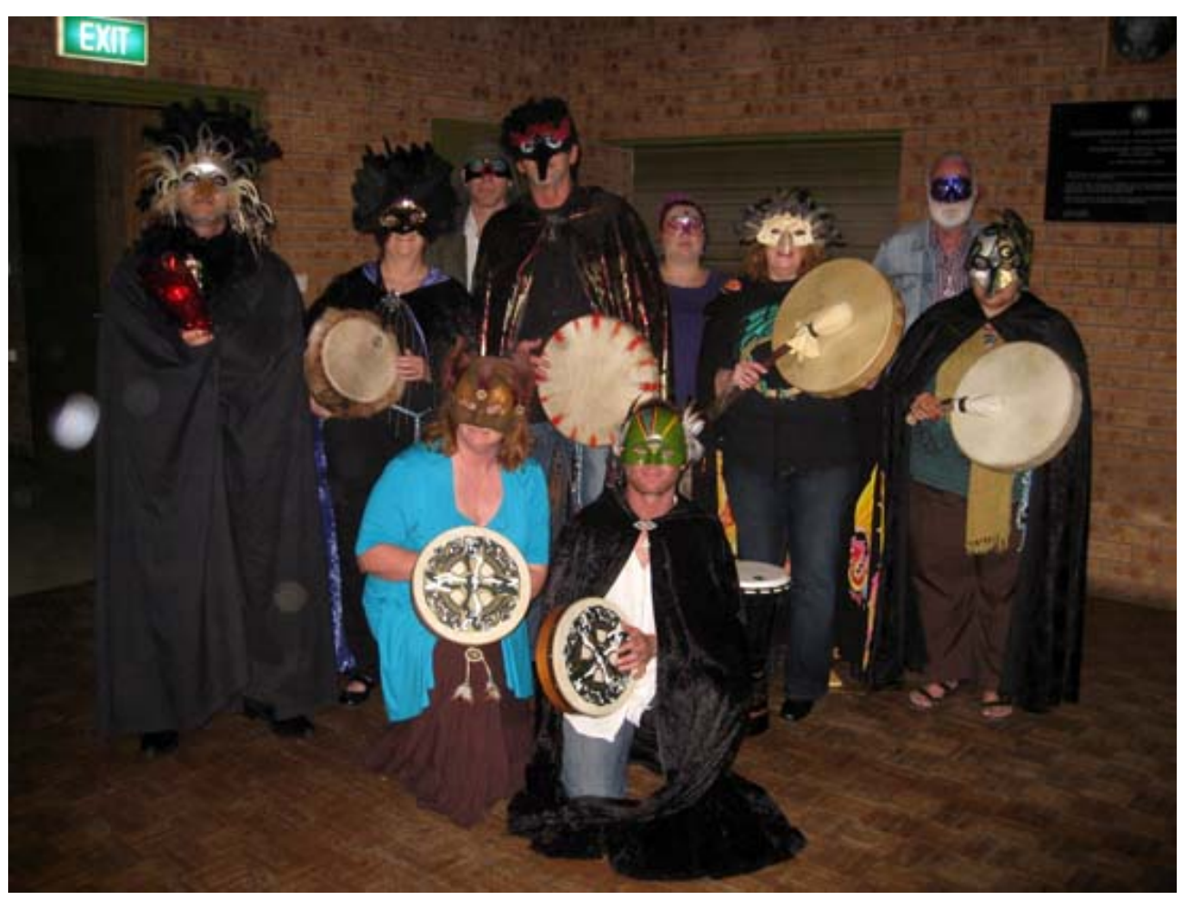
All participants wore masks which we made at our Beltane Weekend.

Goddess - Ix Chel, Mother of the world and all being, was the old Moon goddess in Mayan mythology. Ix Chel was depicted as an old woman wearing a skirt with crossed bones, and she had a serpent in her hand. Ix Chel is also the protector of weavers and women in childbirth.