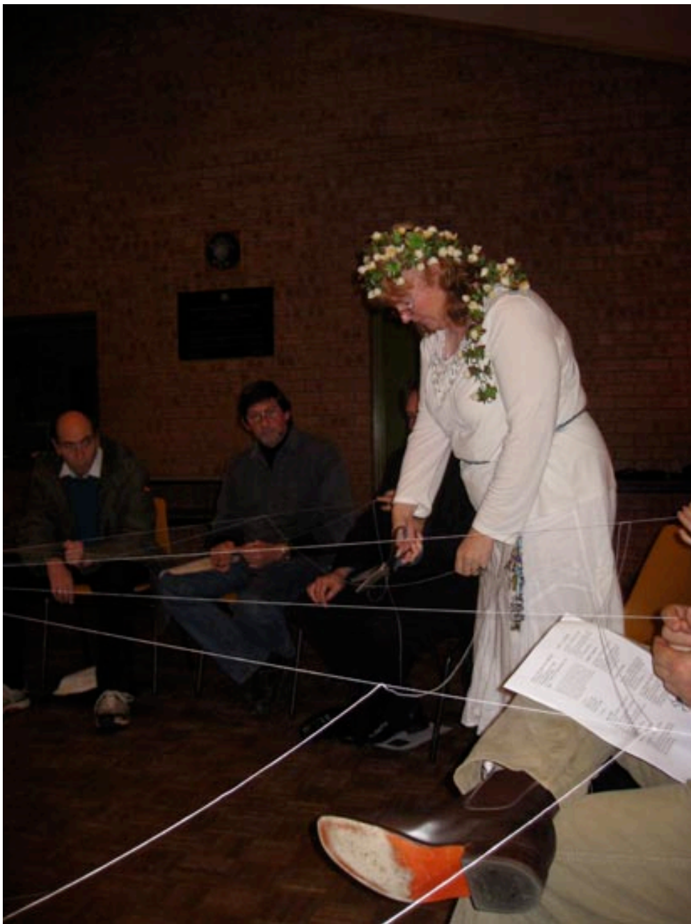
Atropos cutting the web

Earth my body Water my blood Air my breath And fire my spirit