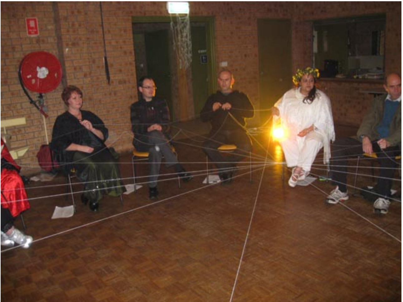
Spinning the web