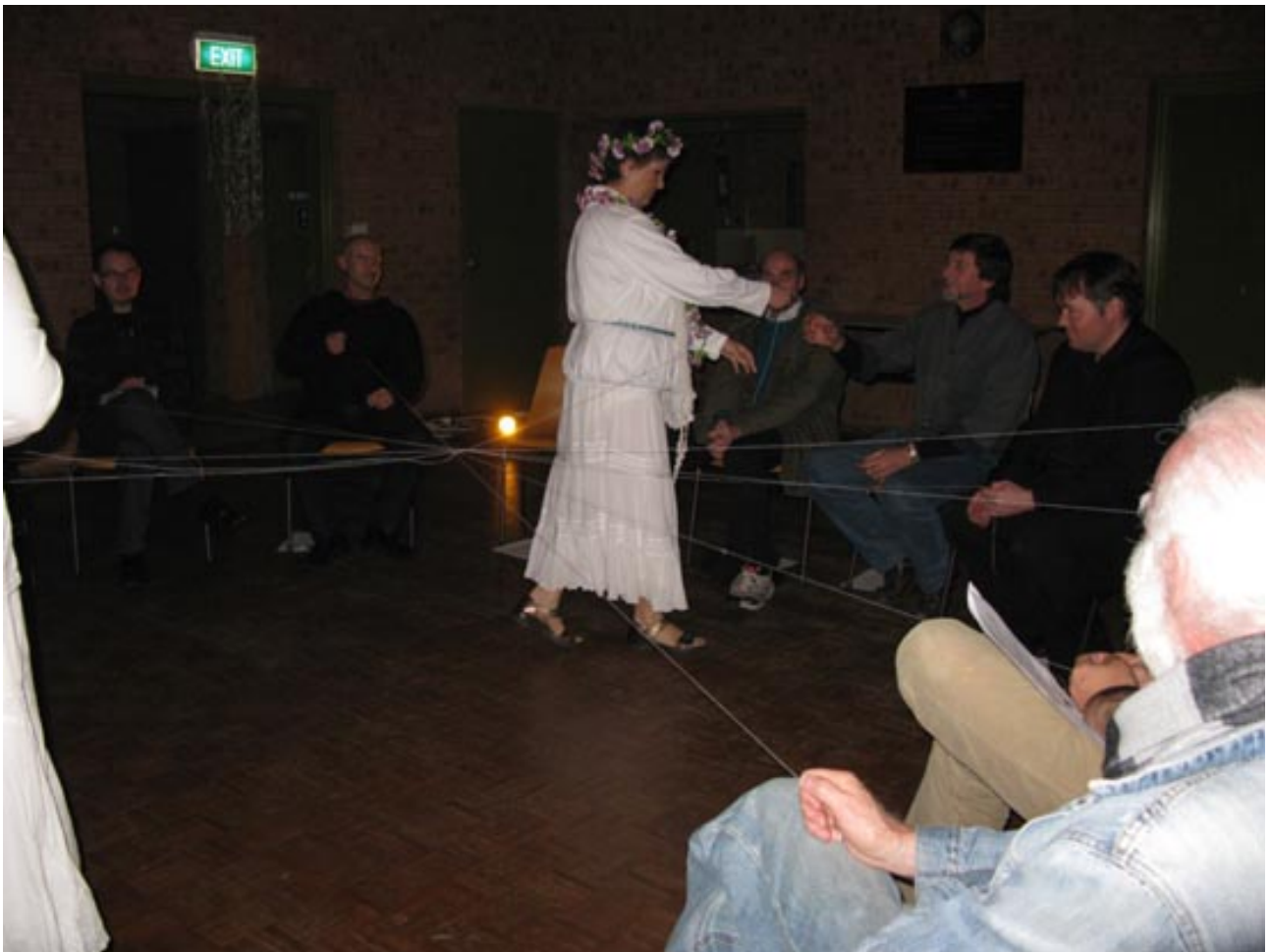
Lachesis measuring the threads

(The Three Fates move into the centre of the circle and start to weave their threads into the Web of Fate.)