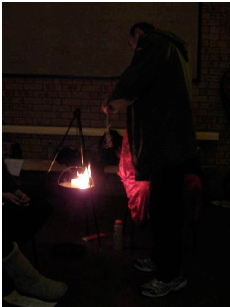
Burning the web