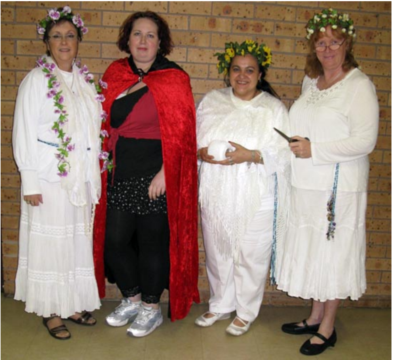
The Three Fates and Athena (Renee)