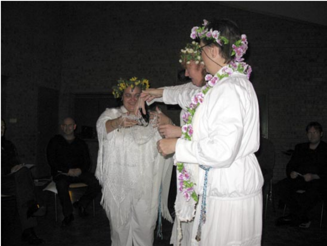
The Three Fates gathering up the last pieces of web