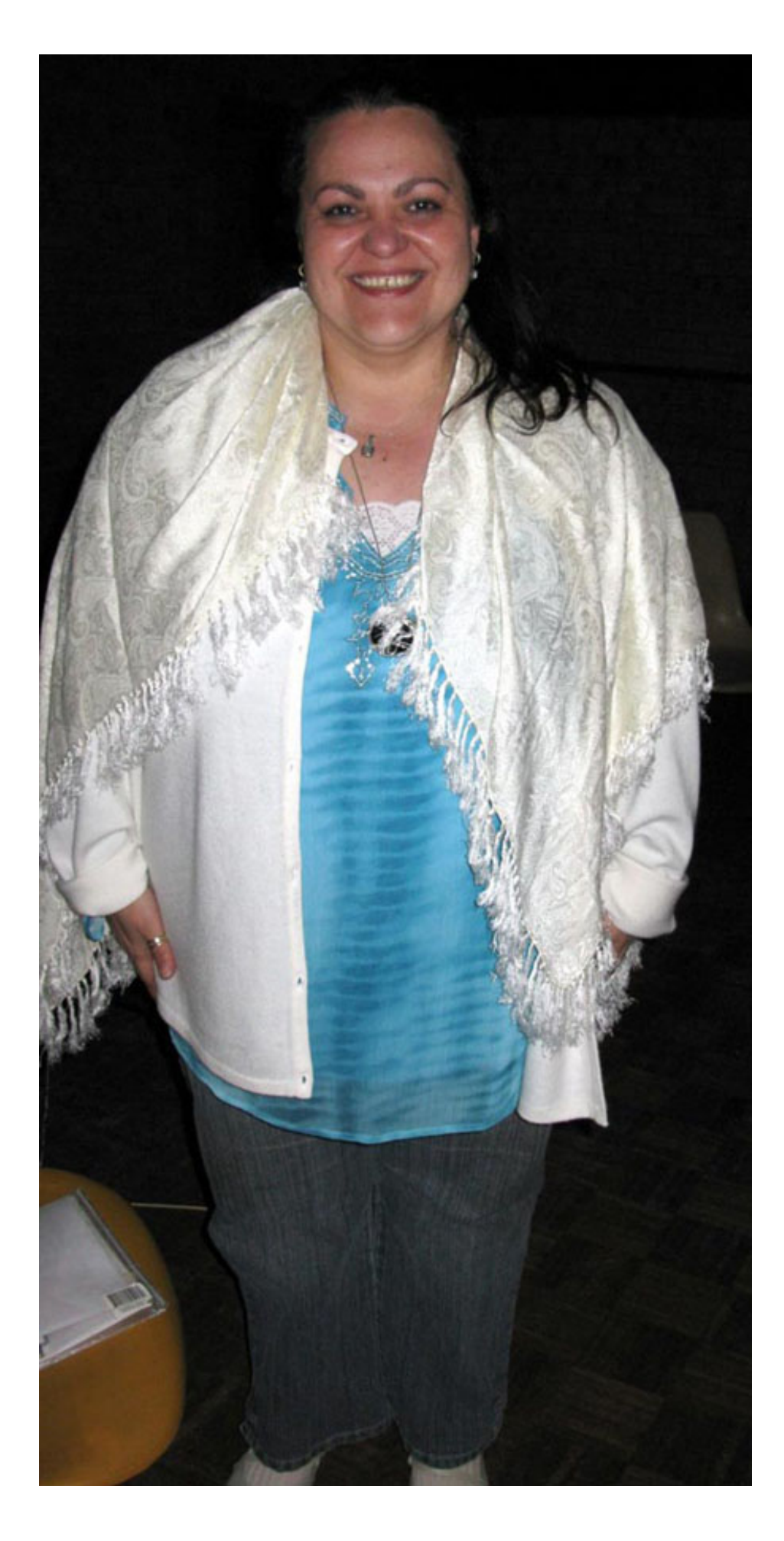
East - Air - Maria