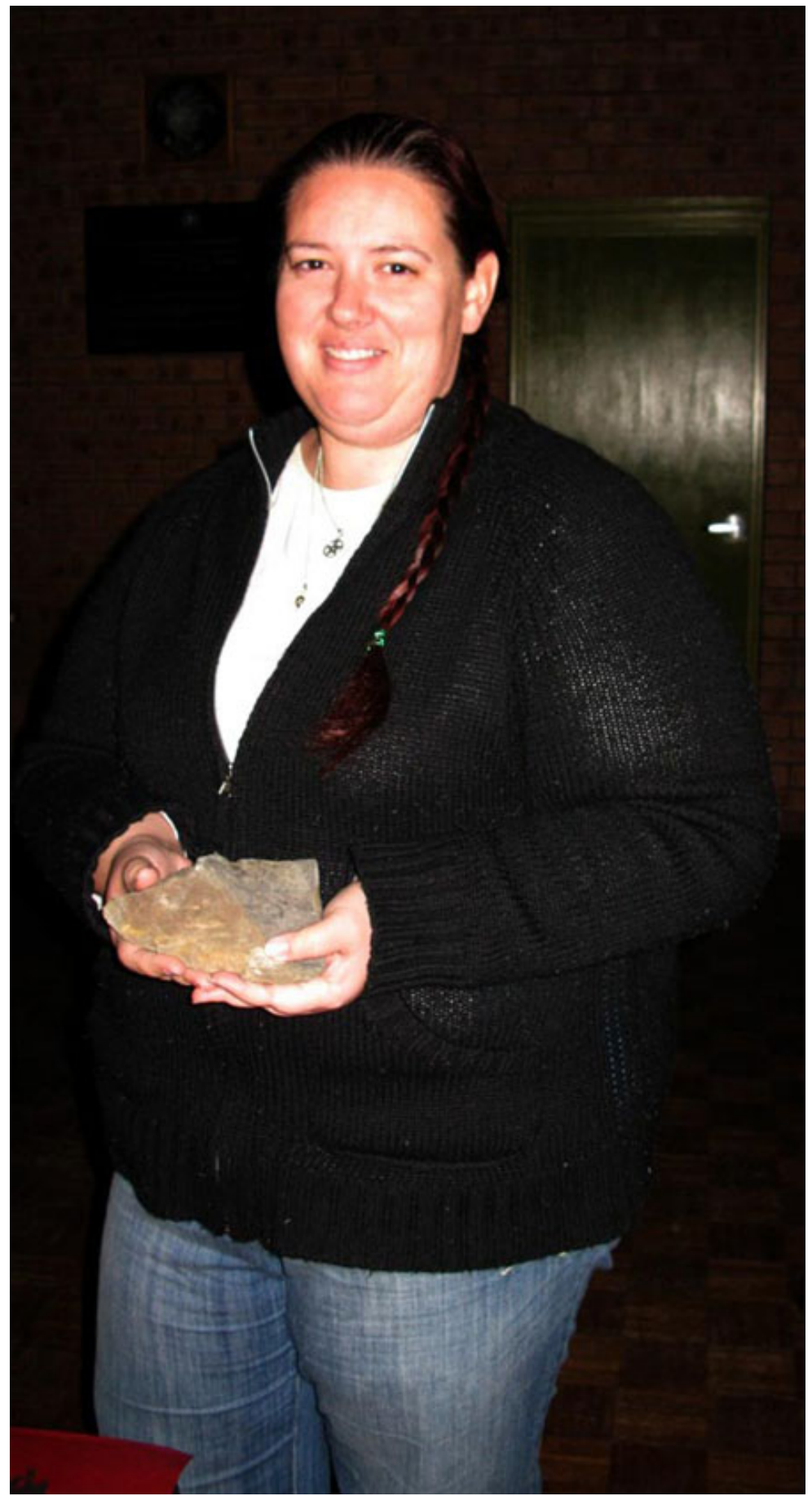
South - Earth - Sam