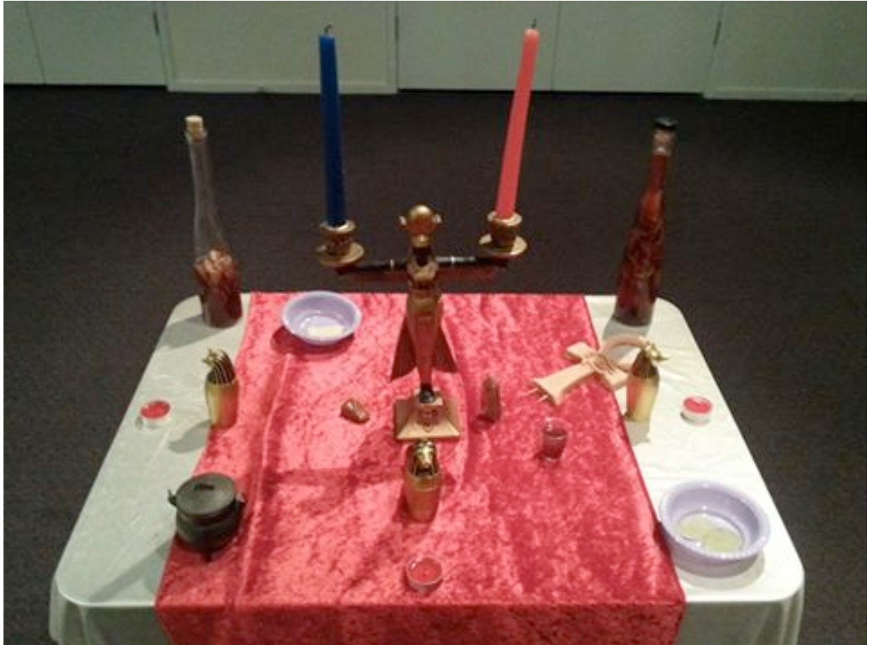
Nowra Altar - 19th February 2016

Bind to me by wind and sea, flame and stone The strength of will, the steady flow From Ptah's thought and Sekhmet's courage The power of mind does strengthen my thoughts Magick, Magick, elude me not By Ptah's Septre and Sekhmet's Ankh This spell is now made, So Mote It Be.