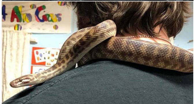
Logan with 'Nudge' — our ritual serpent guest of honour.